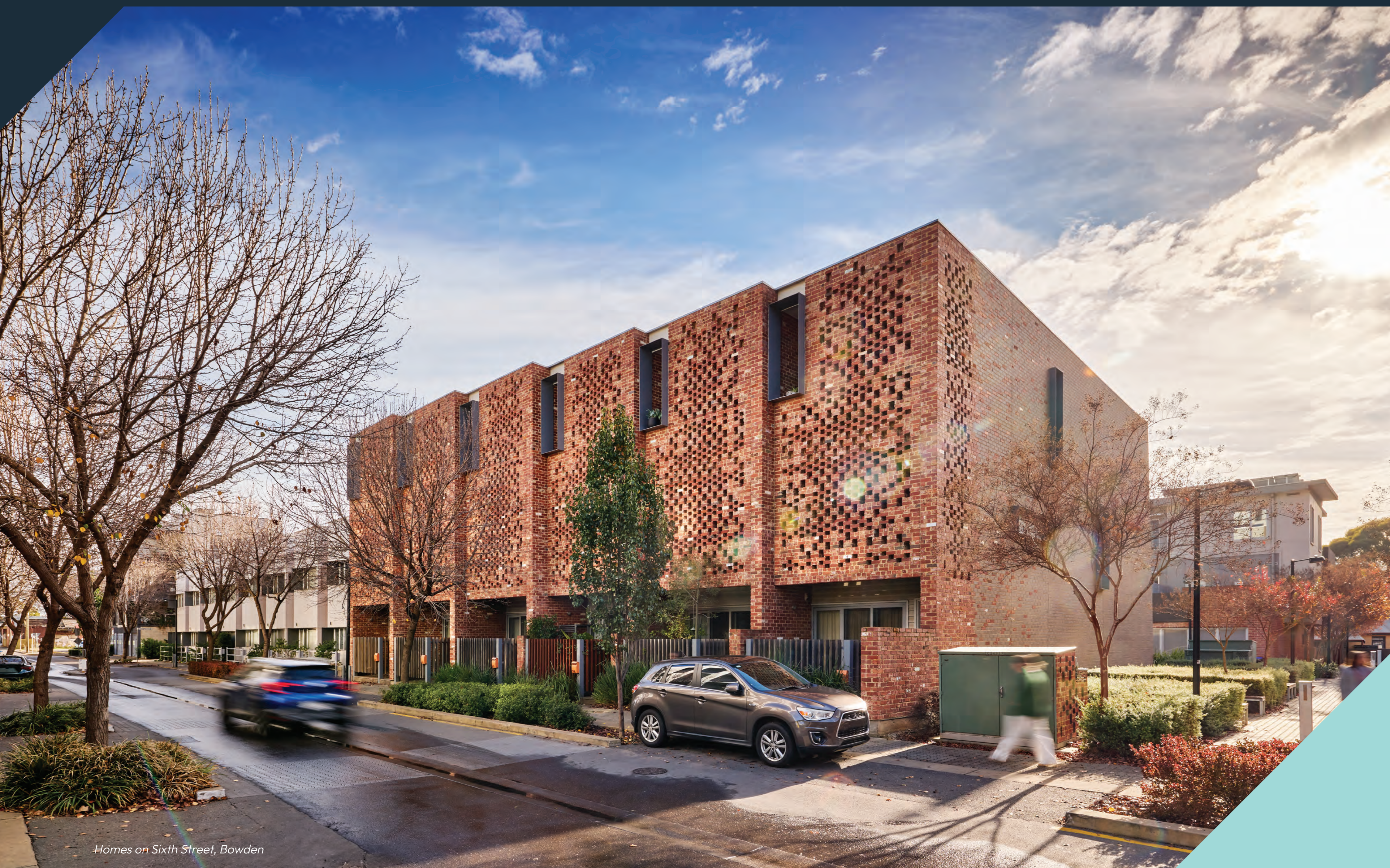
Homes on Sixth Street, Bowden