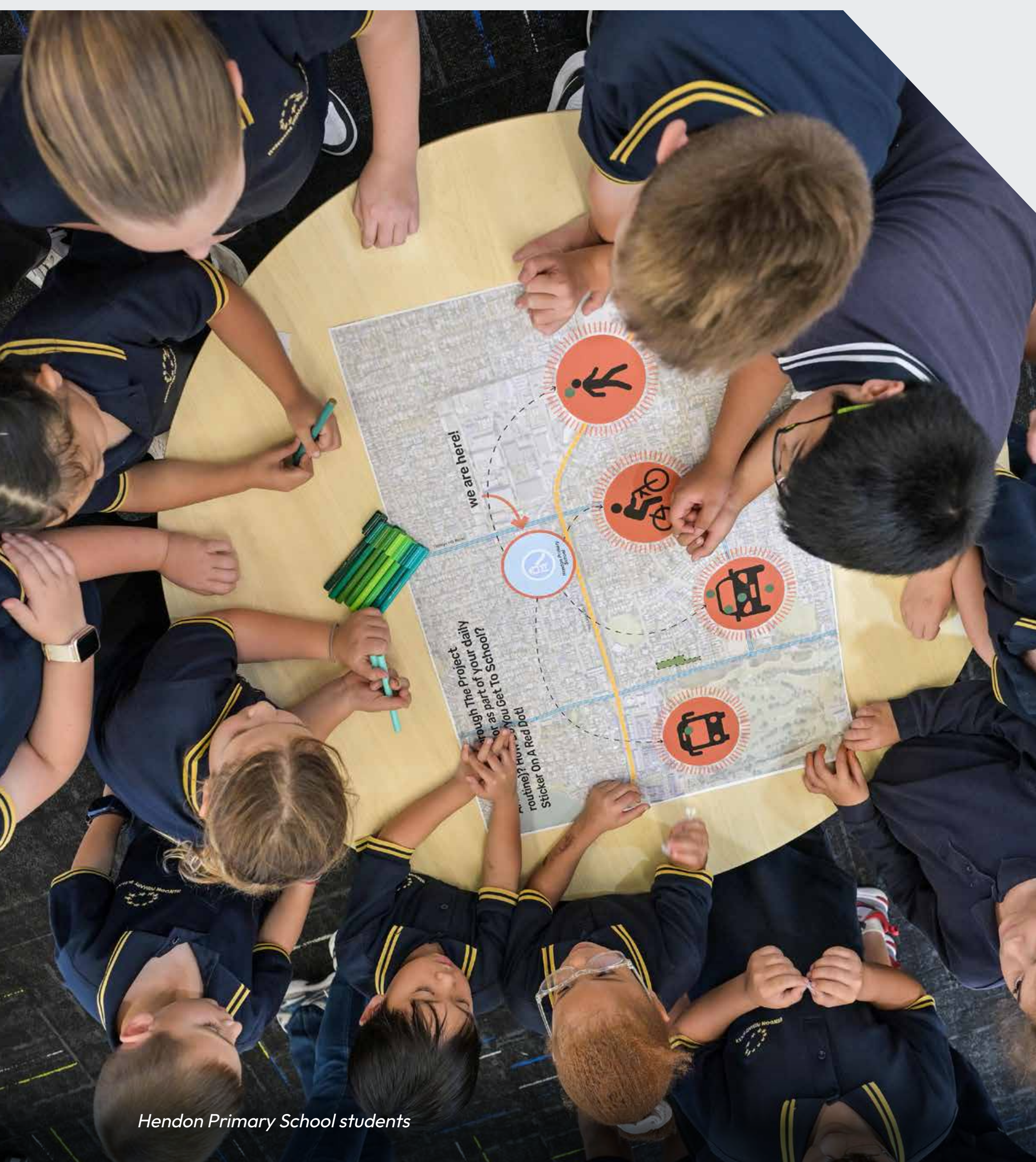
Hendon Primary School students

This engagement enabled young people, whose school is a two-minute walk from the proposed park, to provide insightful feedback on their local environment and influence the landscaping design.