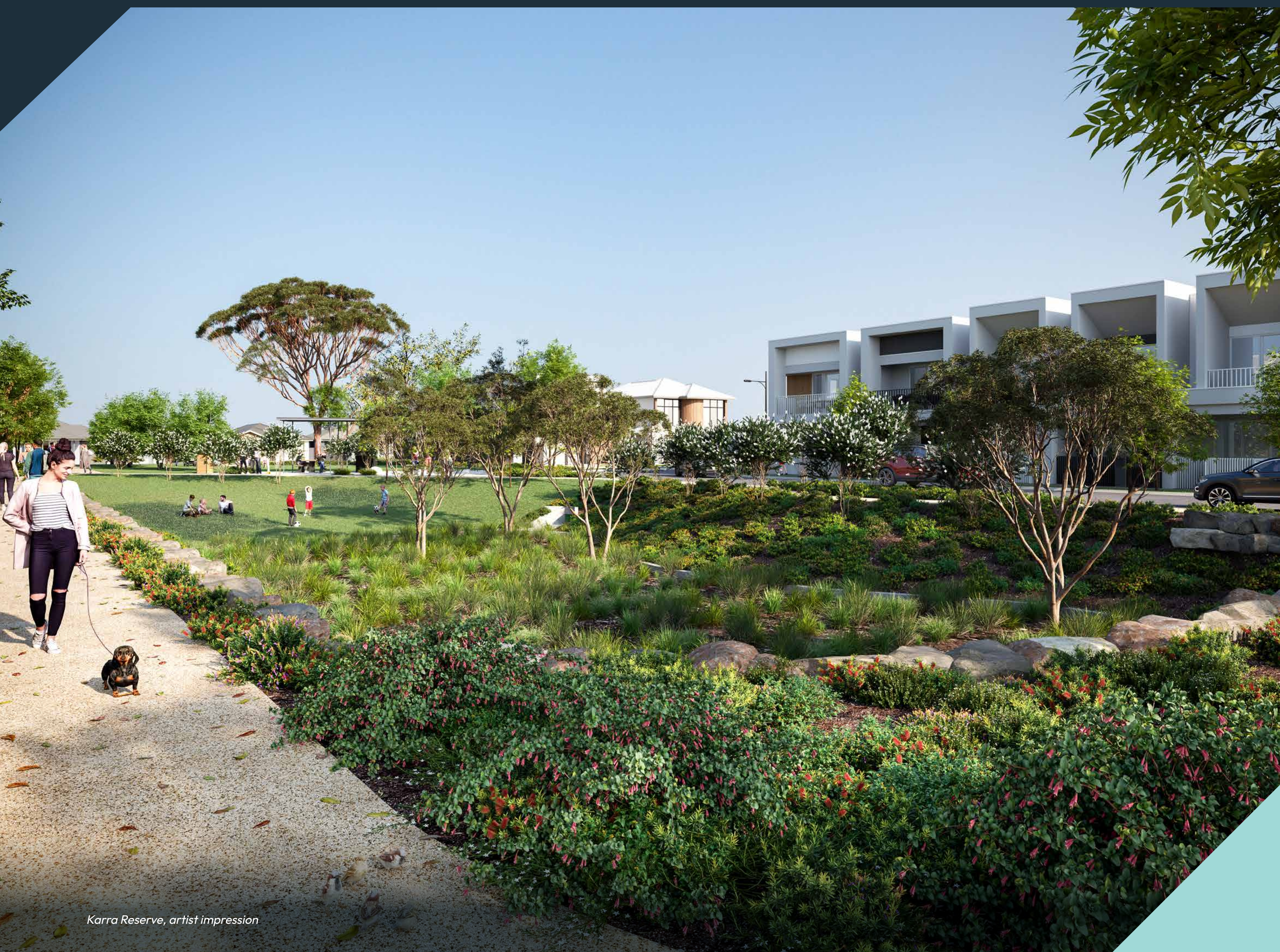
Karra Reserve, artist impression

This new community park, the first for the Seaton project, will serve as a central hub for community connection and recreation. It will feature wetlands, landscaping, trees, grassed area, shaded areas, shelter, picnic tables with seating/benches, bike racks and community BBQ facilities.