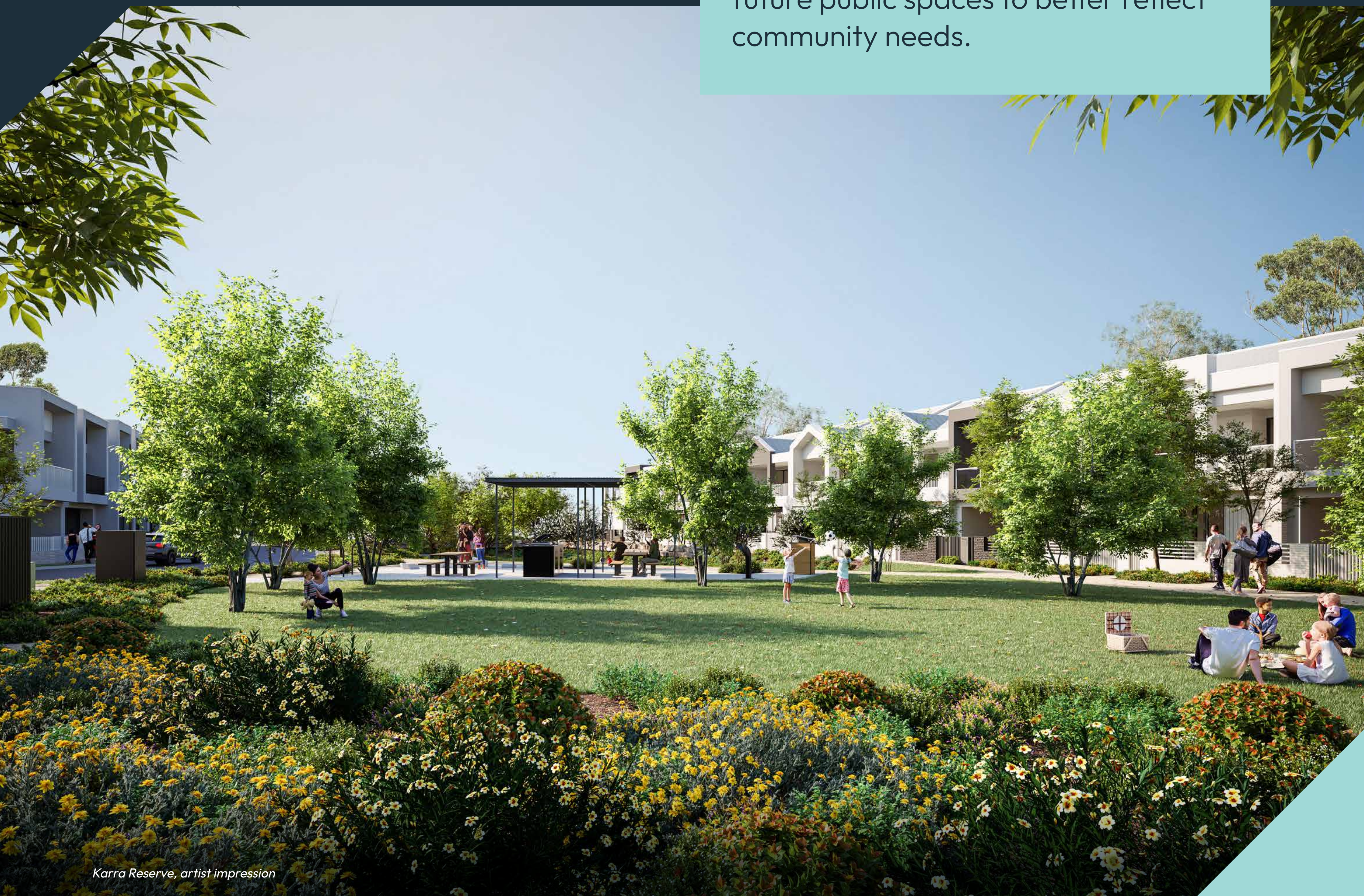
Karra Reserve, artist impression

Your feedback will help shape the future public spaces to better reflect community needs.