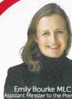
Emily Bourke MLC Assistant Minister to the Premier

I HAVE LIVED IN [REDACTED] 64 yrs AND ITS BEEN WONDERFUL BUT I'M NOW WORRIED ABOUT THE FUTURE PLANS. THE NUMBER OF HOMES PLANNED FOR THE UNI GROUNDS AND THE TRAFFIC ISSUES, PARKING AND NUMBER OF INFLOW OF PEOPLE. MY DRIVE WAY BACKS ON TO THE ENTRANCE OF THE UNI [REDACTED] AND ITS AN ISSUE FOR ME AS IT IS NOW SO GOD KNOW WHAT ITS GOING TO BE LIKE AFTER: 4