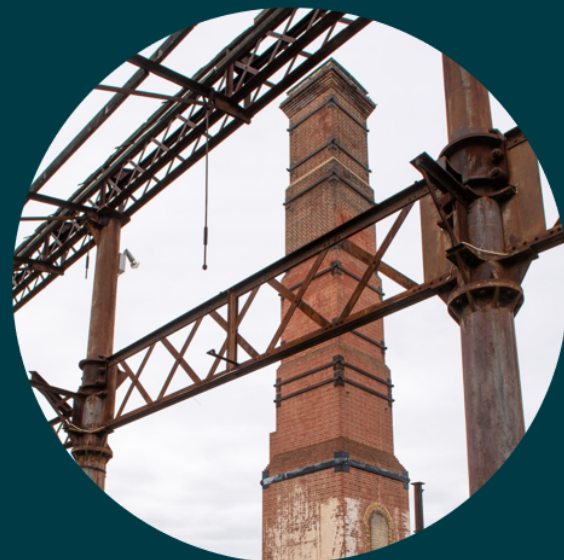
CULTURE & HERITAGE

The principles have been developed based on the themes of: Culture & Heritage, Identity, Community, Connection, Movement & Access and Sustainability.